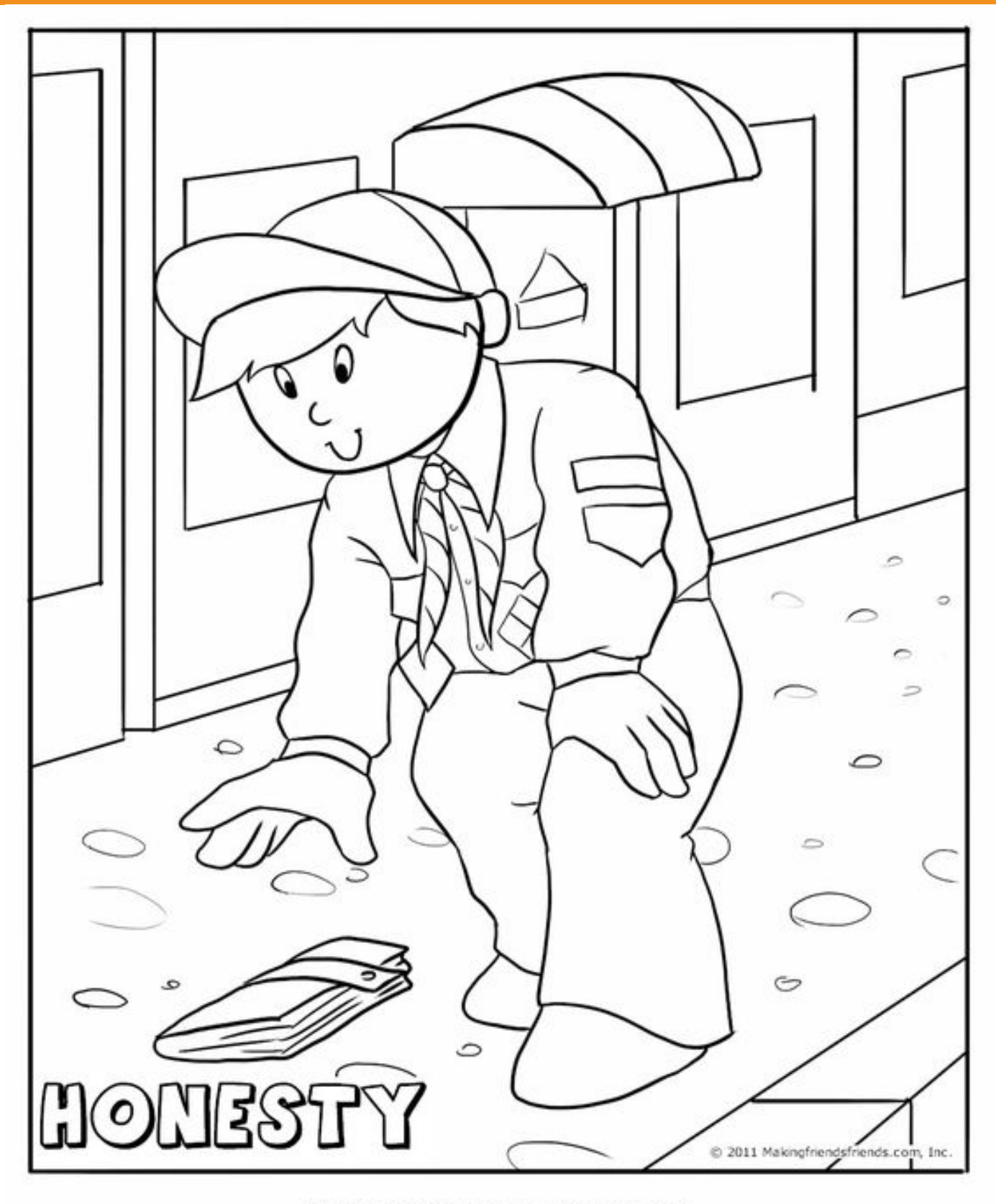
I tell the truth and I am trust worthy.